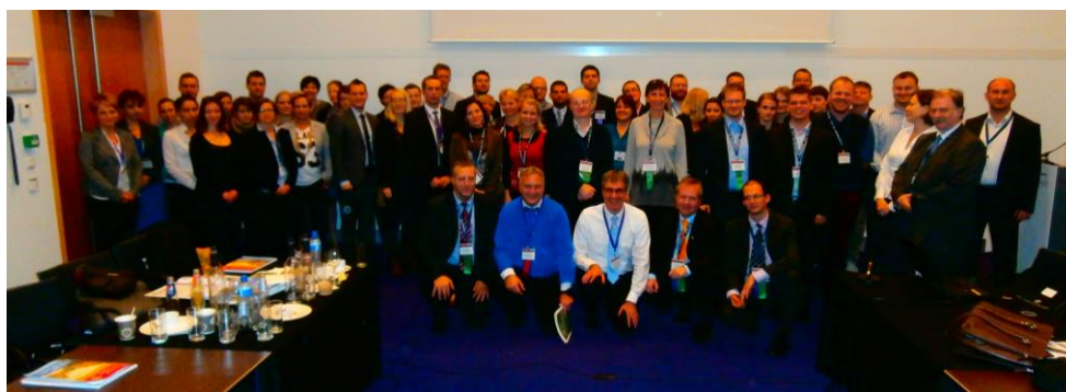
ISPOR Congress, Amsterdam